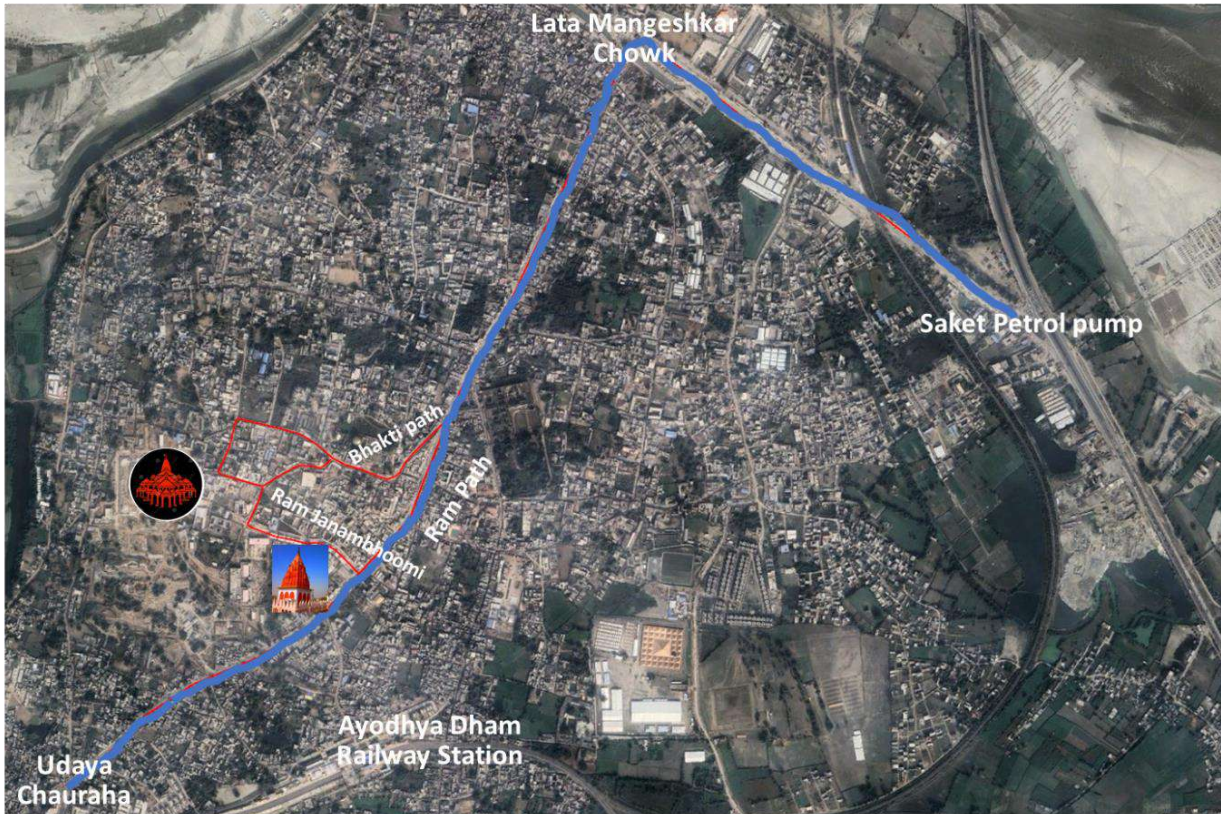
Figure 1 The route map

In 2021, Ayodhya Development Authority came out with a vision to develop the City as a “Global Spiritual destination” by 2047. One of the major Goal to achieve this vision is promotion of “Diversified tourism” and many projects such as Surya Kund, Ghats, Ram Ki Paidi, old temples and Math mandirs have been developed or restored as a testament to ADA's commitment to preserving Ayodhya's heritage while enhancing its contemporary vibrancy. Since the consecration of the Shri Ram Janam Bhoomi, lakhs of visitors and devotees are visiting Ayodhya. The main road approaching the temple area is closed for regular traffic between Saket petrol pump to Tedhi Bazaar which is almost a 6km stretch hence it becomes difficult for devotees and visitors especially universally challenged to walk the long stretch in scorching heat to reach the temple area. Through E rickshaws ply in this stretch but it is difficult to regularise them, hence it is important to enhance the public mobility within the Ayodhya town area for an easy and organised commute of the devotees and visitors in the proximity area of Ram Janmabhoomi.